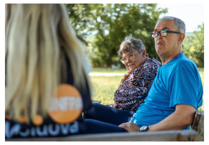
UNFPA Safe Spaces provide a lifeline to refugees with disabilities in Moldova through support and belonging.

44,600 People reached with SRH information, referrals and services