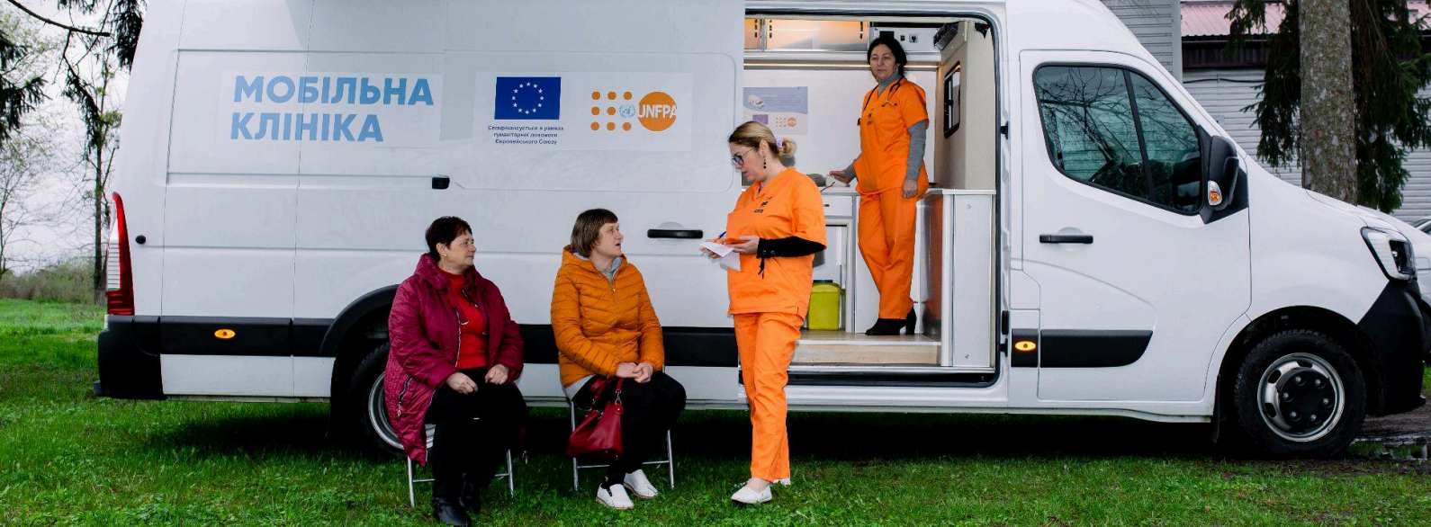
UNFPA-supported SRH Mobile Health Unit, Cherkasy region, Ukraine.