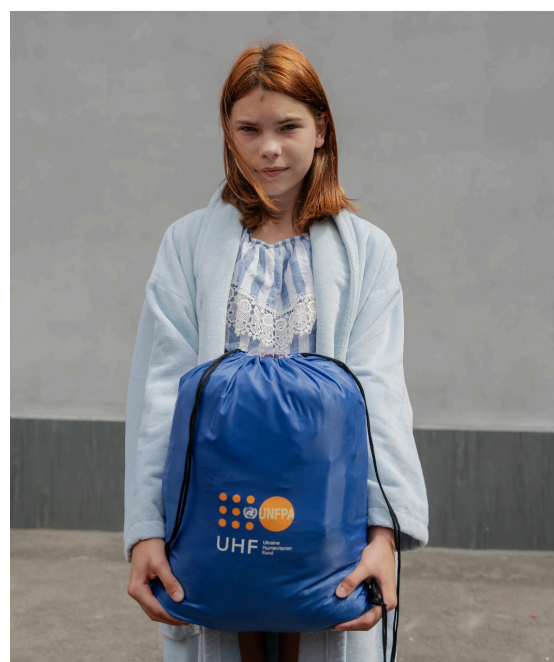
Kherson-Kakhovka Dam, Ukraine.

Since the beginning of the war, donor support has enabled UNFPA to save lives, restore services and implement sustainable solutions, such as bulk procurement of pharmaceuticals and medical devices. However, as local supply chains recover, multi-year funding becomes essential to ensure uninterrupted delivery of essential medicines and to enable UNFPA and its partners to respond effectively to changing needs and strengthen local capacities.