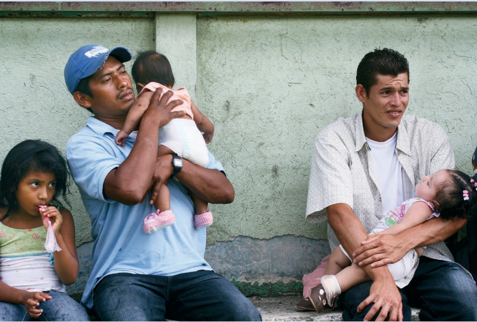
Fathers in Costa Rica attend an information fair on sexual and reproductive health.