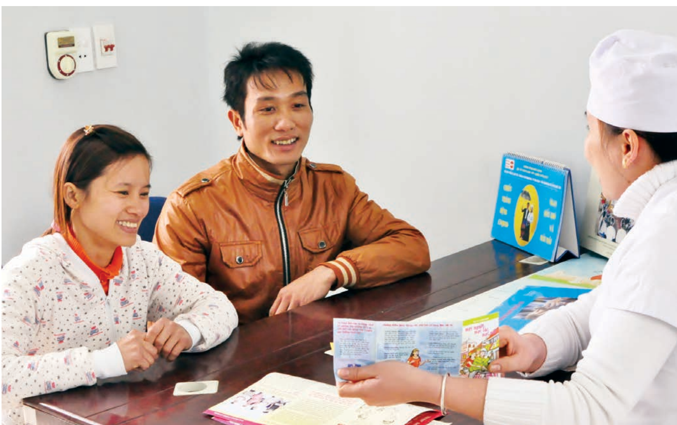
Family planning counselling in Viet Nam.