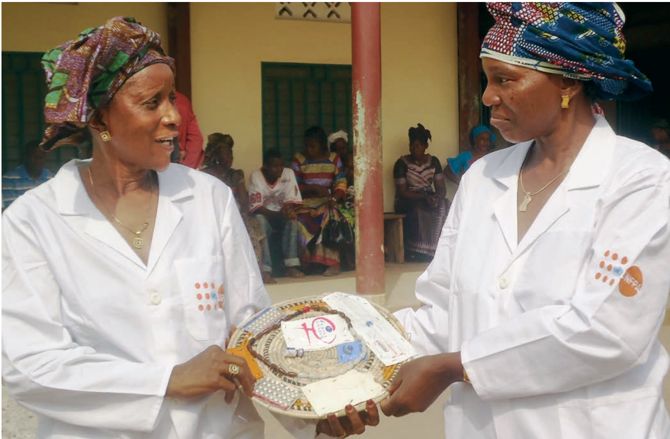
Choice of contraception at a health clinic in Guinea.