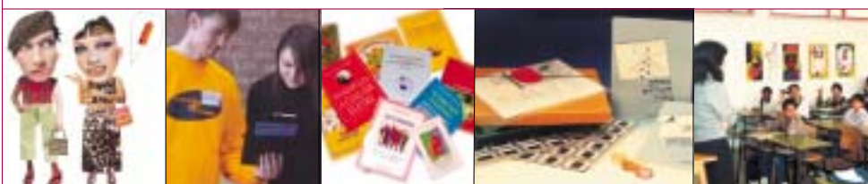
Cover illustration © Anne Mette Edeltoft