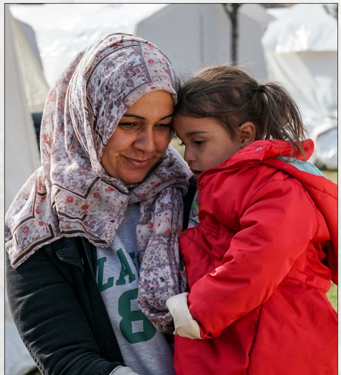
UNFPA visits people currently sheltered in a temporary camp in Gaziantep following the devastating earthquakes. UNFPA is in affected areas assessing and responding to the needs. Pictured is a mother with her daughter who are in need of emergency accommodation.

Key Populations: According to the Key Refugee Groups Thematic Coordination Group that held post-earthquake assessment meetings with partners on the ground, key populations continue to experience challenges in specialized services such as healthcare services or psychosocial support services. Due to discrimination and stigma, GBV incidents involving key populations appear to have increased in the earthquake zones and the provinces where key populations have moved.