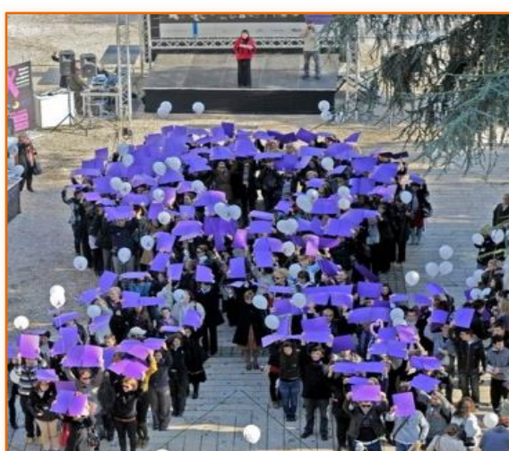
UNFPA leads public awareness campaigns to combat gender-based violence in FY Republic of Macedonia