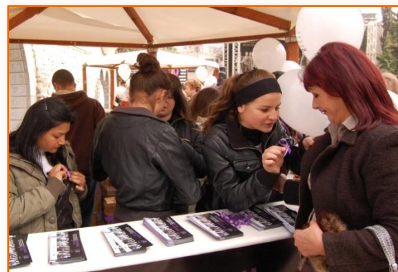
UNFPA works with women and girls of FY Republic of Macedonia to promote gender equality and improve reproductive health