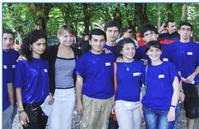
The First Lady of Georgia, Sandra E. Roelofs, with youth and peer educators presenting a sexual and reproductive health information session at a Youth Summer Camp

The UNFPA in Georgia has built partnerships with the government, UN agencies, donors, professional associations, national institutions, NGOs and youth organizations. Public-private partnerships, successfully developed by UNFPA have been key to the programme's success. In 2009, the UNFPA country office initiated the Black Sea Coalition for Breast and Cervical Cancer Screening, chaired by the First Lady of Georgia, Sandra E. Roelofs. This highly successful coalition is an alliance of policy makers, technical experts and clinicians from 8 member countries in the region (Armenia, Azerbaijan, Bulgaria, Georgia, Moldova, Romania, Turkey and Ukraine) to cooperate and share knowledge on breast and cervical cancer prevention.