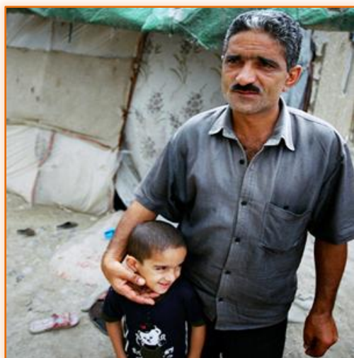
UNFPA helps to strengthen national capacity in collecting accurate data to address demographic challenges.