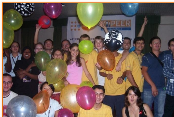
UNFPA assists in developing youth-sensitive policies and empowers youth to be responsible for their health