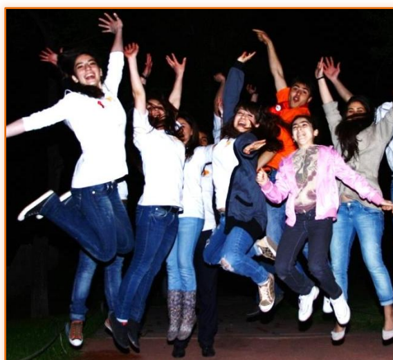
UNFPA works with young people in Armenia to improve sexual and reproductive health awareness including HIV