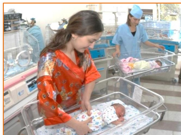
UNFPA supports maternal health programmes in Armenia